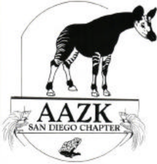
The San Diego AAZK Chapter

Zoo Keepers, Inc. (AAZK), a non-profit, tax-exempt organization with offices at P.O. Box 120551, San Diego, CA 92112; (619) 231-1515 ext. 4672. Address for editorial, advertising and membership inquiries: San Diego AAZK, P.O. Box 632984, Hillcrest Post Office San Diego, CA 92103. Reproduction or use without written permission of editorial or pictorial content in any manner is prohibited. Copyright © 1996 by the San Diego Chapter of AAZK. Subscriptions are included with the membership in the San Diego Chapter of AAZK or may be received for $12 per year. Payable in U.S. currency only. The Keeper assumes no responsibility for unsolicited materials. Manuscripts or artwork not accompanied by a self-addressed, stamped envelope may not be returned. The Keeper makes every effort to ensure that the products and services advertised in our pages are consistent with